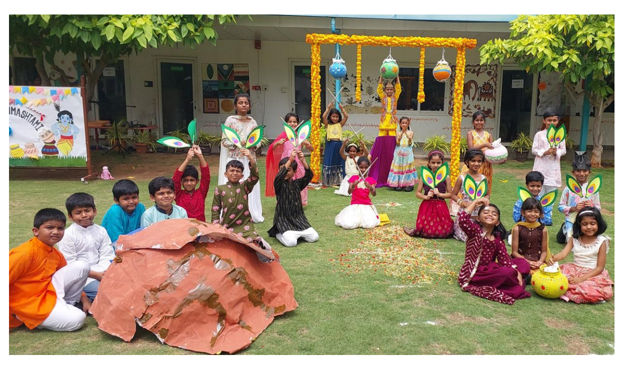
All about the Janamashtmi celebrations.