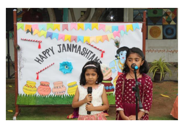
Students performing at Janamashtmi celebrations