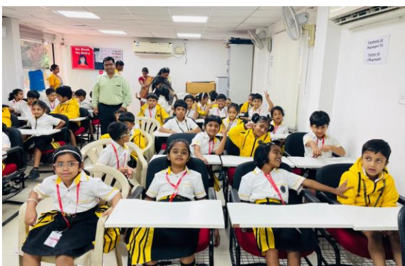
Field trip to the 'Traffic Training Center.'