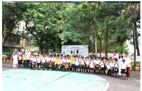
Field trip to the 'Traffic Training Center.'