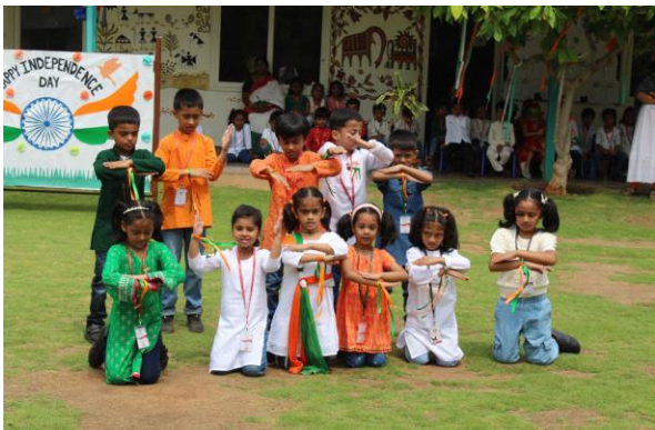
Independence Day Celebrations