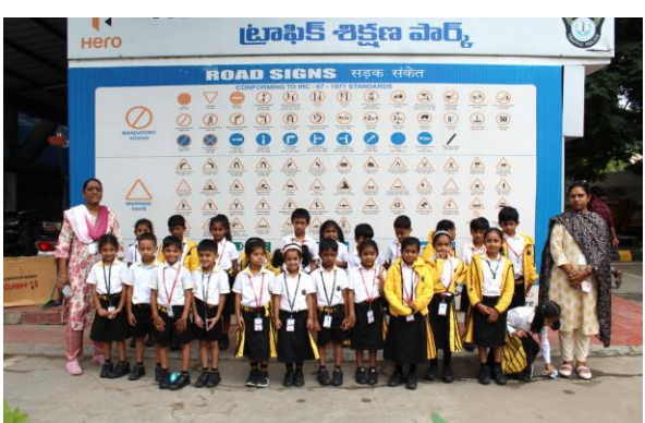
Field trip to the 'Traffic Training Center.'