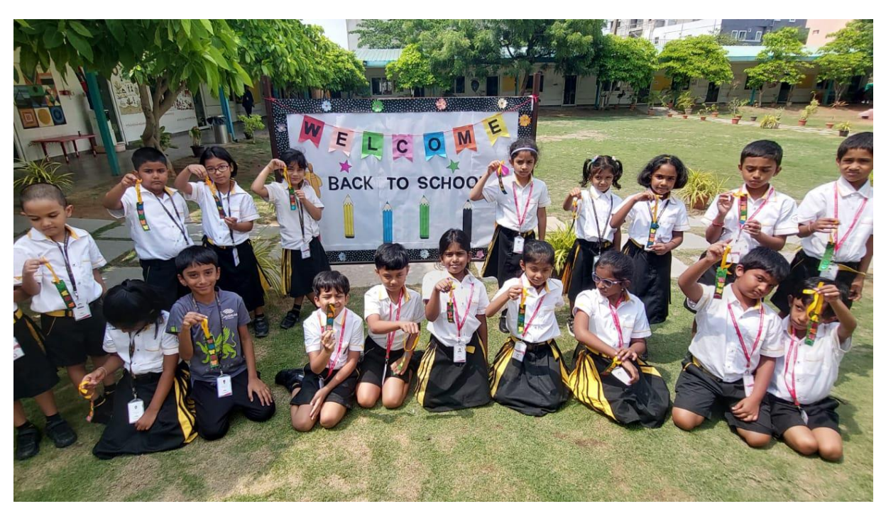
Students with their takeaways - bookmarks