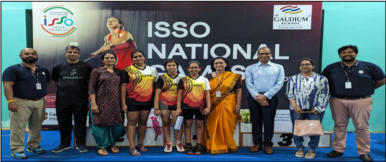
The ISSO National Games held at our school were a triumphant celebration of sportsmanship and talent. With participants from across the country, it was a matter of immense pride to see our friends clinch victories in various events. Their achievements not only underscored their dedication and skill but also echoed the collective spirit and determination of our school community. The games truly epitomized the essence of teamwork, perseverance, and excellence.