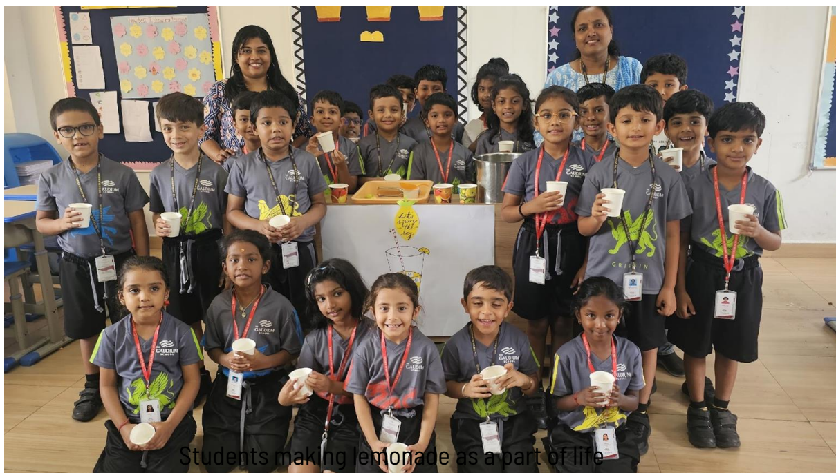
Students making lemonade as a part of life skills.