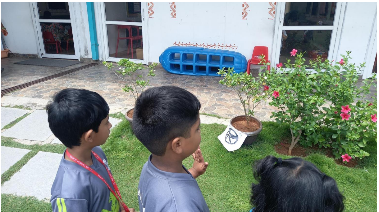
Students exploring different signs and symbols during the school tour.