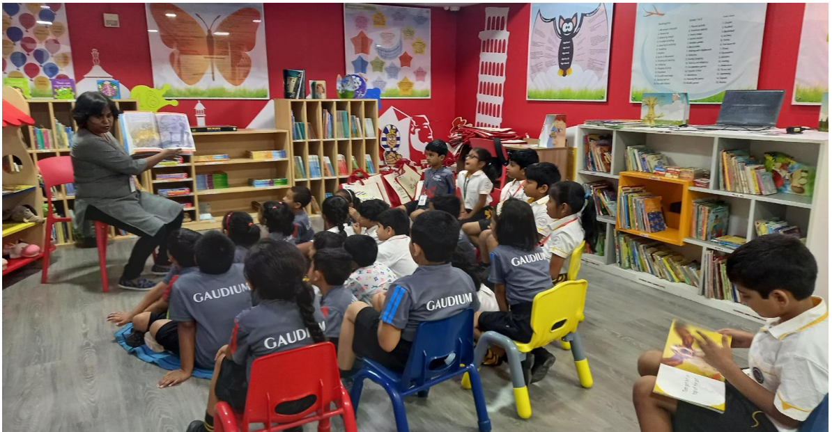
French & Library Classes