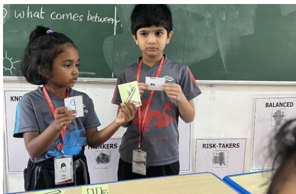
Learners comparing numbers to find out the greater or lesser numbers.