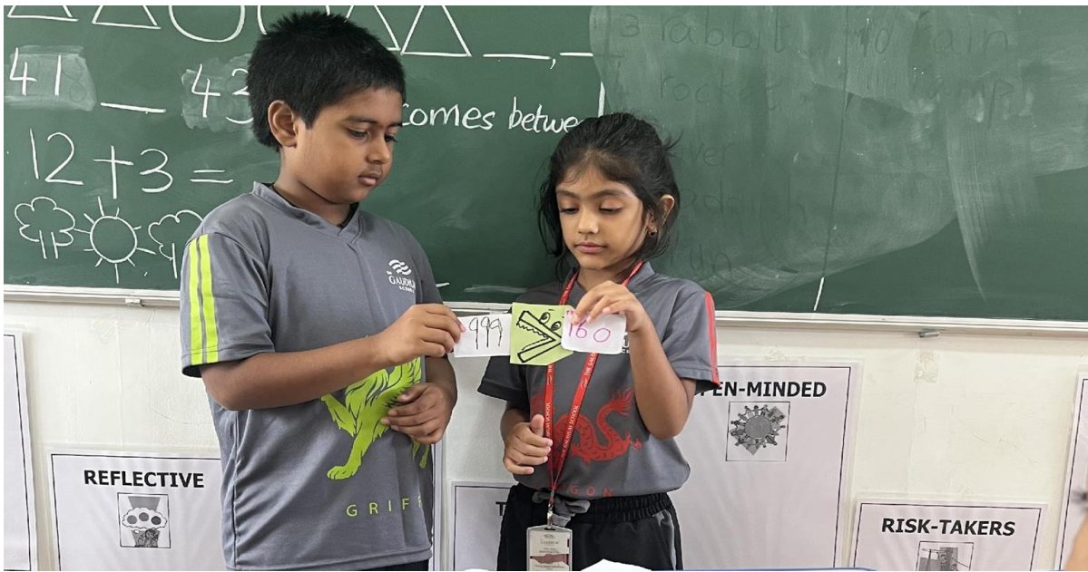
Learners comparing numbers using signs and symbols in math.