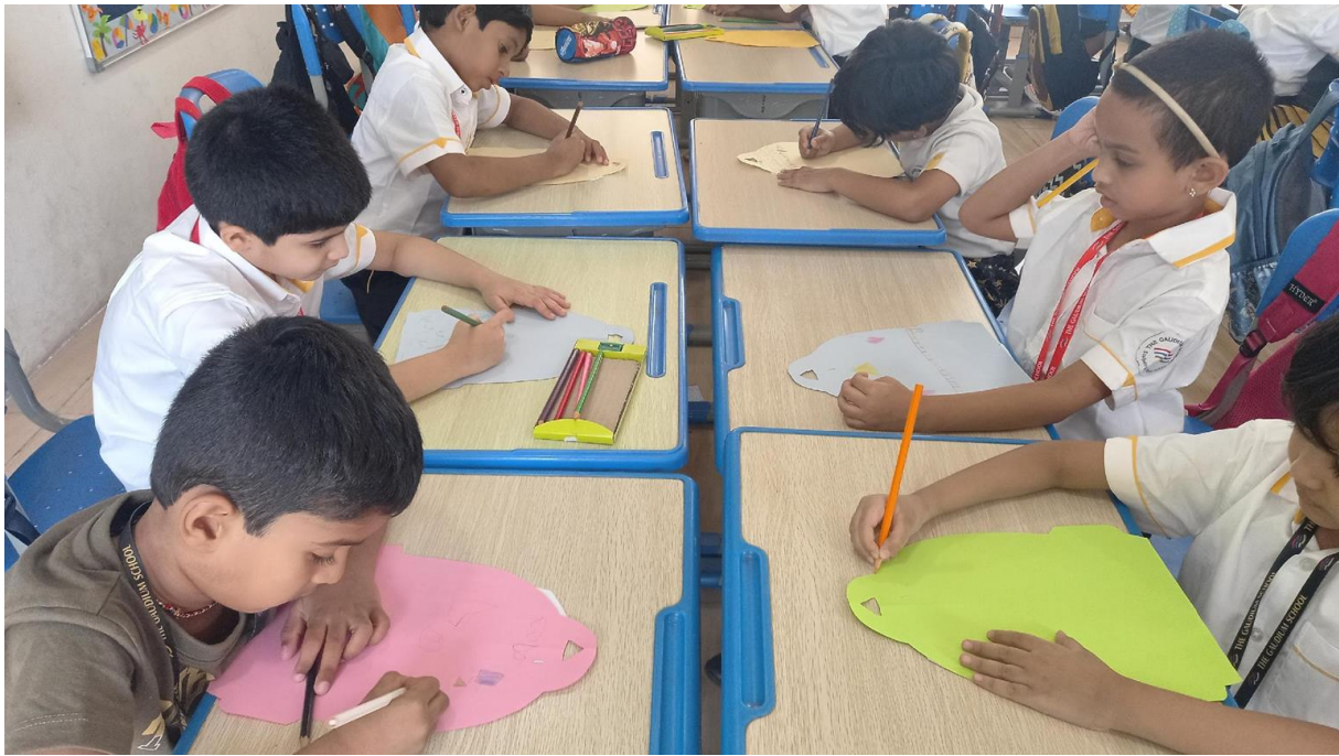
Students designing their take aways