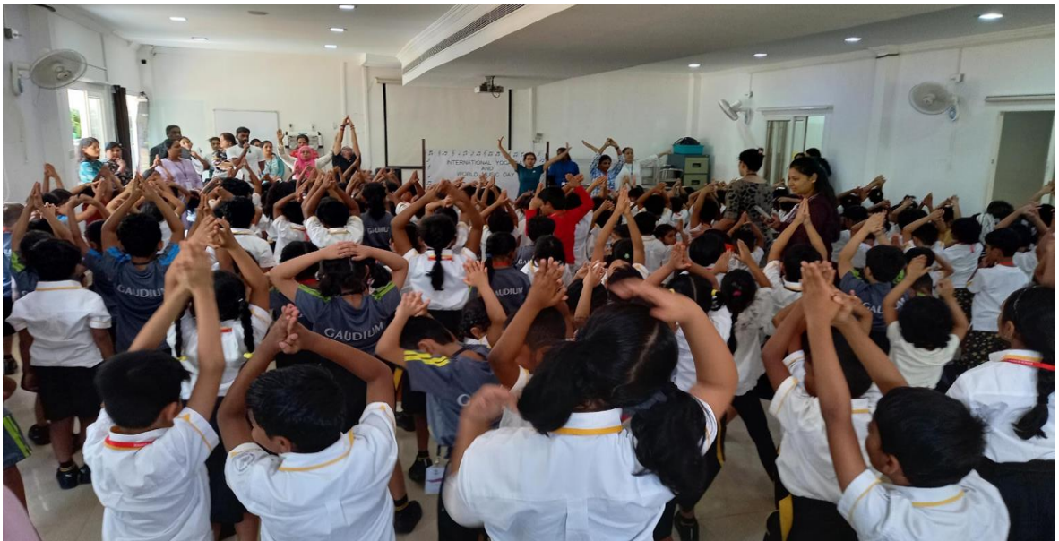
Celebrating International Yoga and Music day.