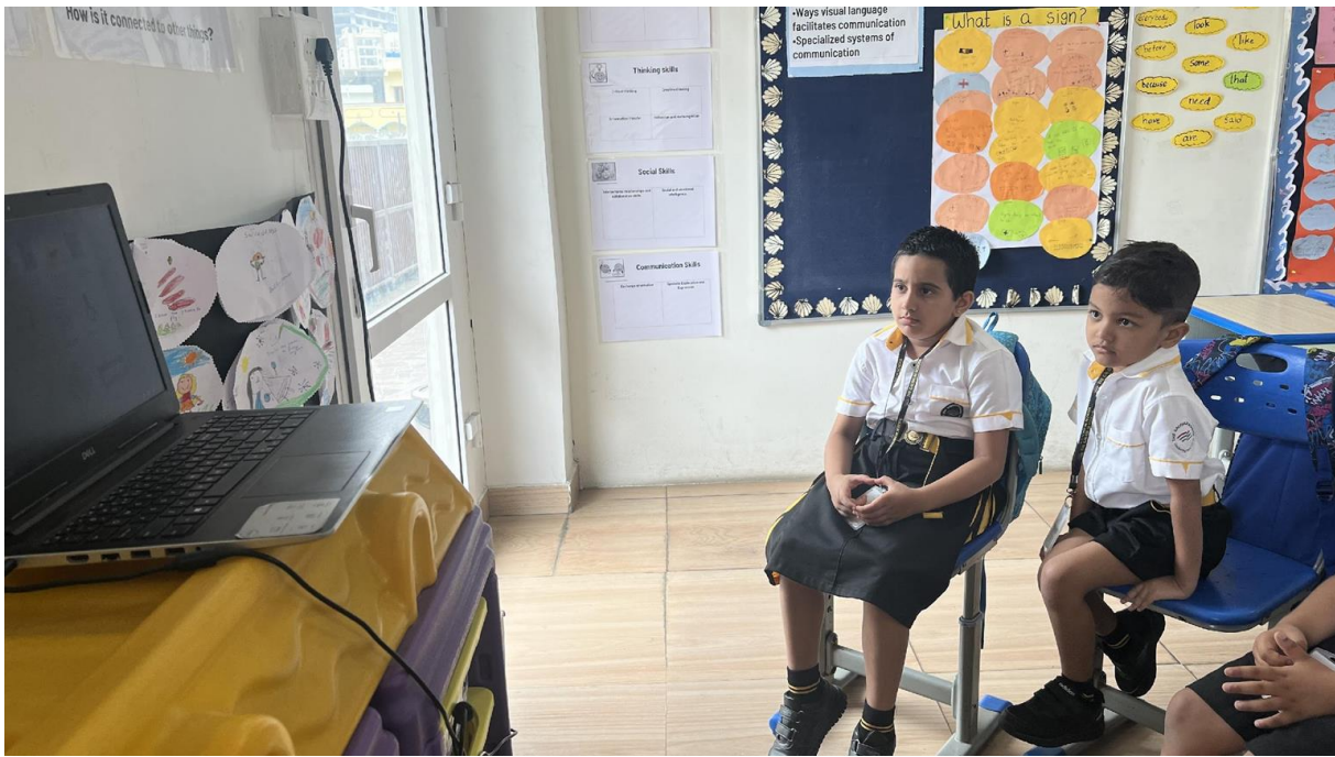
Learners watching the story 'Runaway signs'