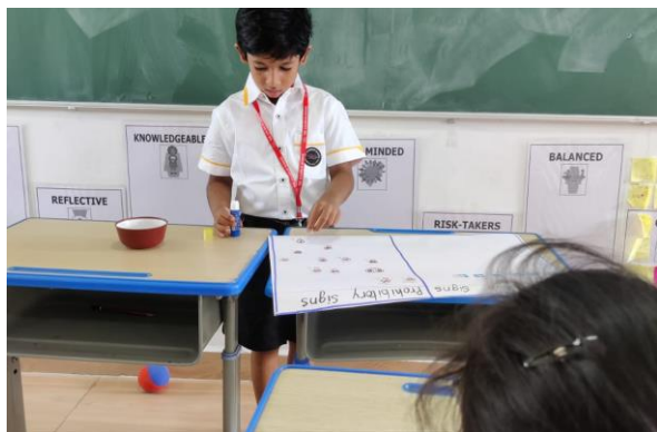
Learners sorting different signs into prohibitory ,warning and informative signs.