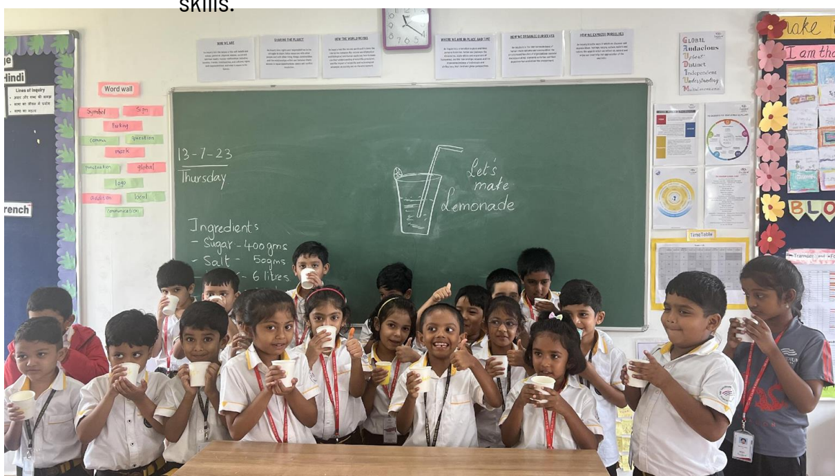
Students made lemonade as a part of the life skills program.