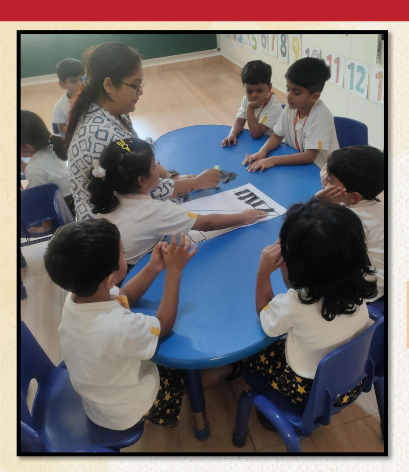
Letter z – Group Learning Engagment