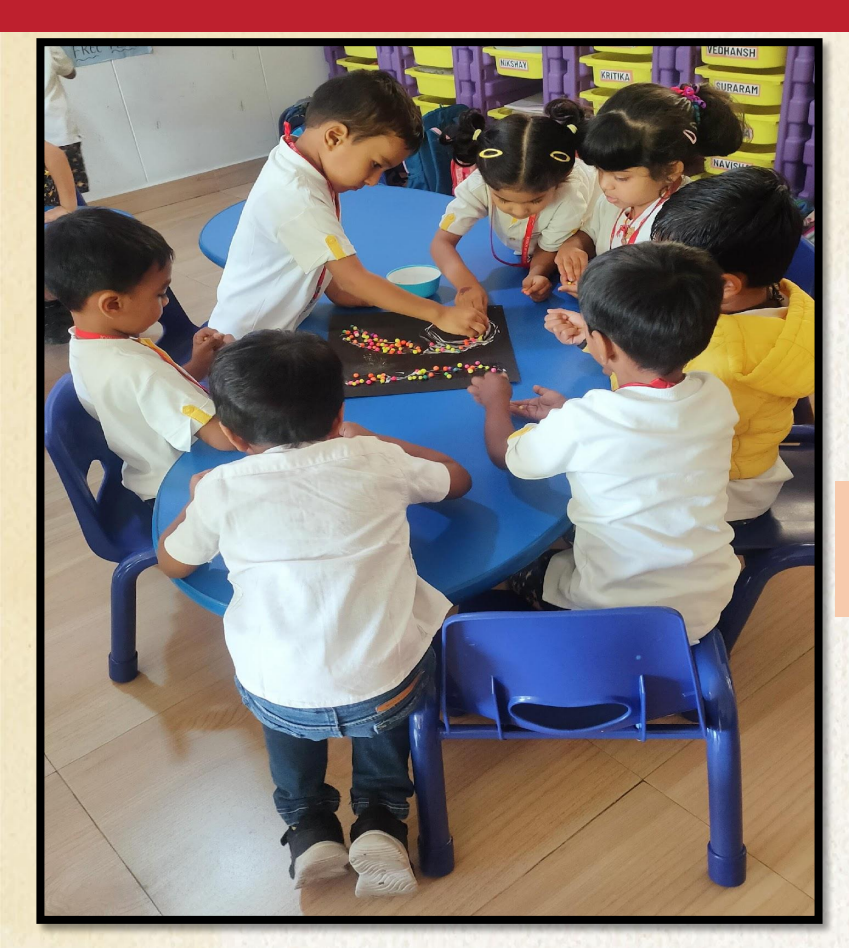
Number 16 Group Learning engagement