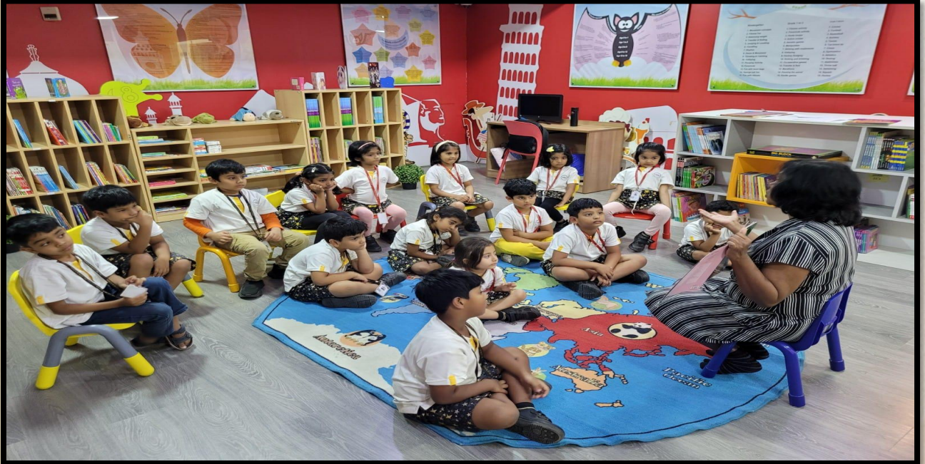
Read aloud session