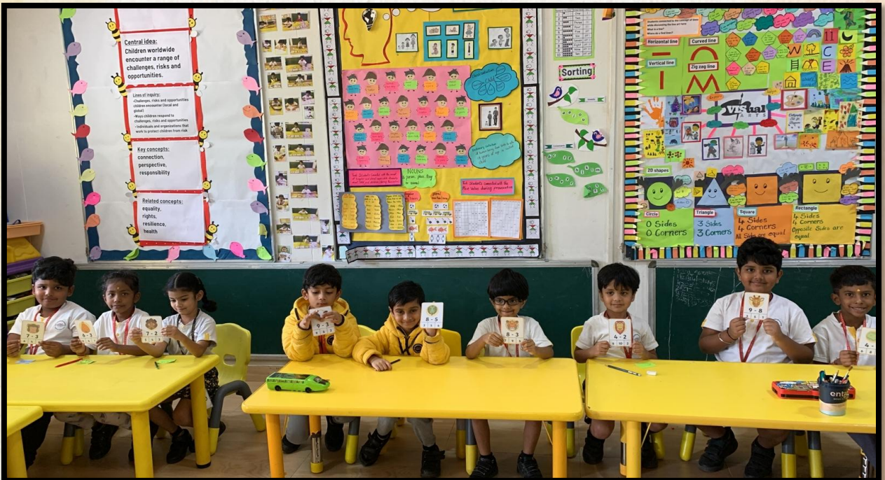
Exploring subtractions through flashcards.