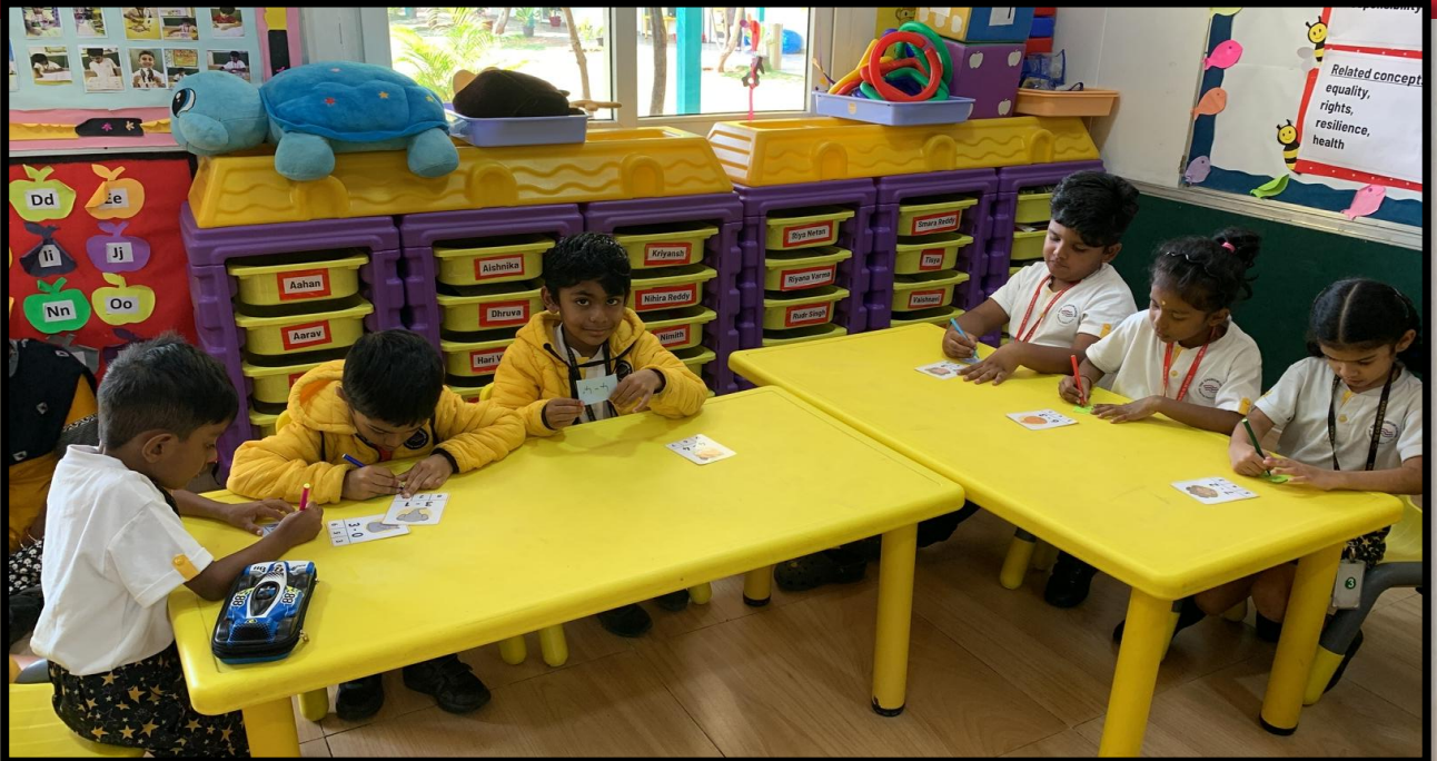
Students explore subtraction through flashcards.