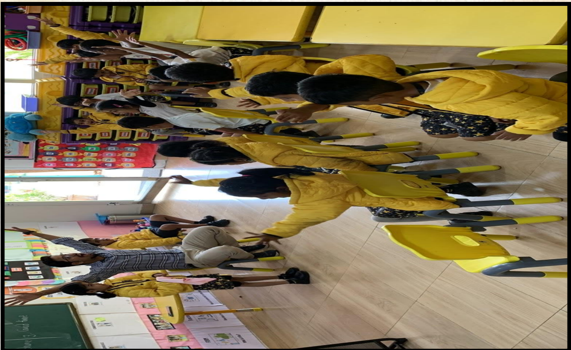
Expressing through emotions in Drama class.