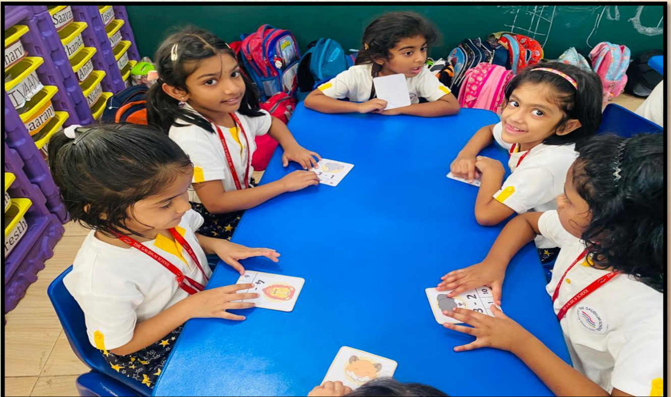
Arranging story in sequence