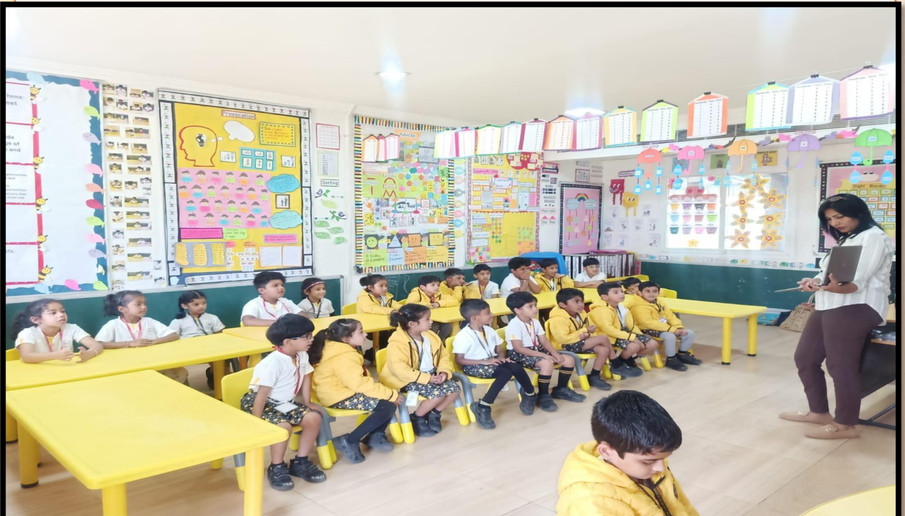
Exploring the meaning of 'Respond and React' through a scenario.