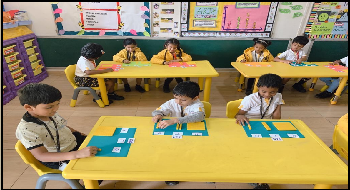
Arranging the place value for the given numbers