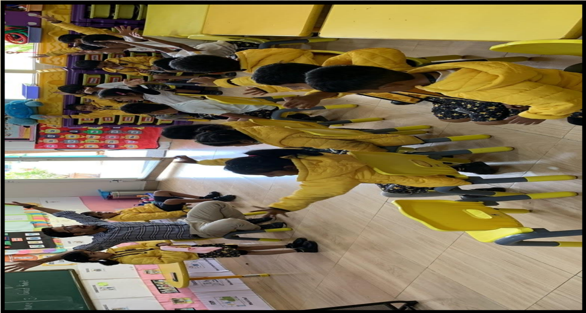
Expressing through emotions in drama class.