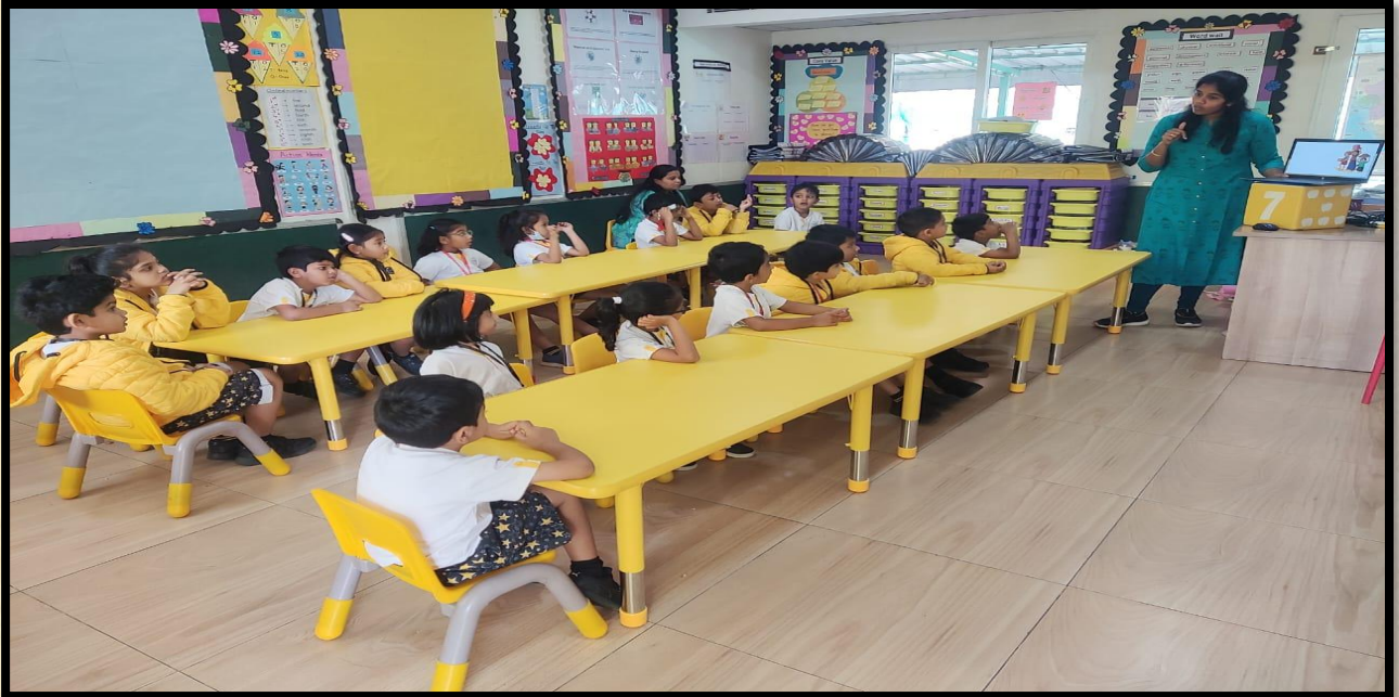
Guest talk by Counsellor for challenges and risks.