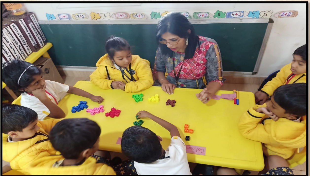
Circle time - sorting even and odd numbers.