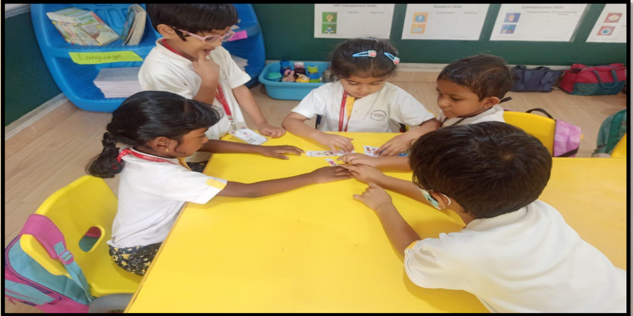
Co-constructing the meaning of the word child