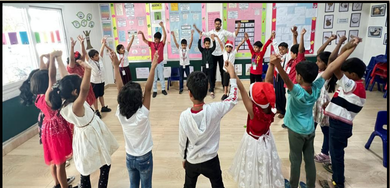
Discussion on Voice Modulation