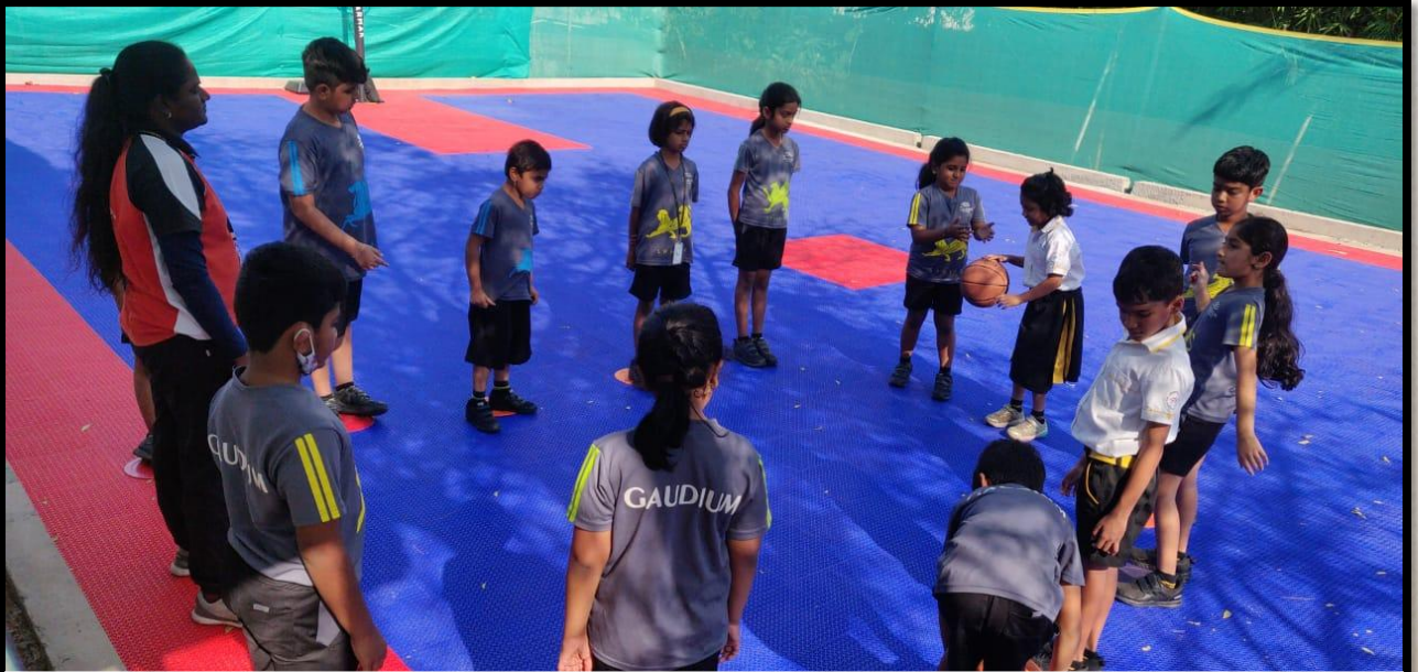
Exploring about different types of throws in athletics events