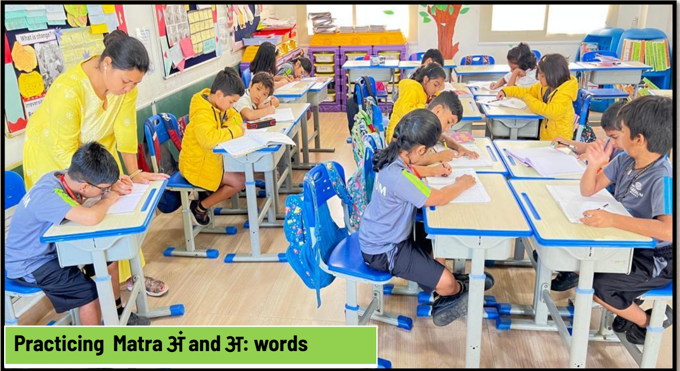
Practicing Matra अं and अः words