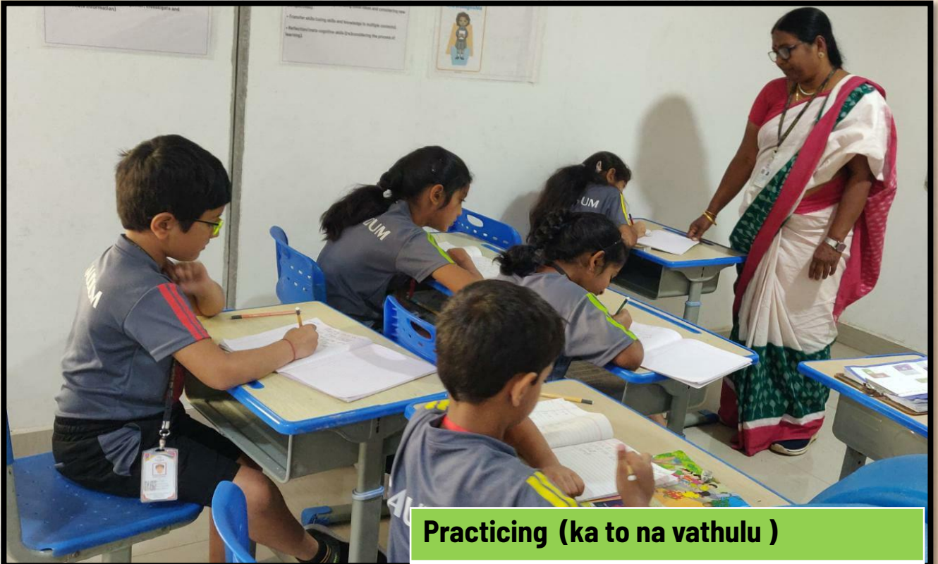
Practicing (ka to na vathulu )