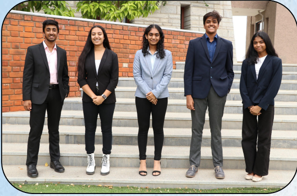
THE CORE SECRETARIAT