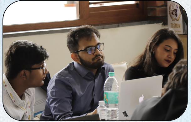
THE EB: UNITED NATIONS SECURITY COUNCIL