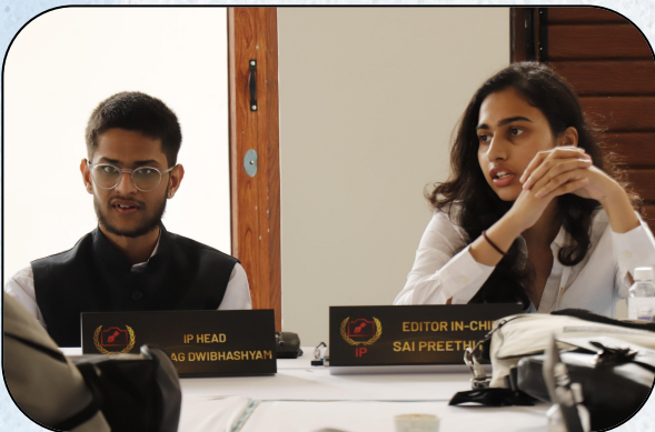
THE DELEGATES: UNITED NATIONS HUMAN RESOURCE COMMITTEE