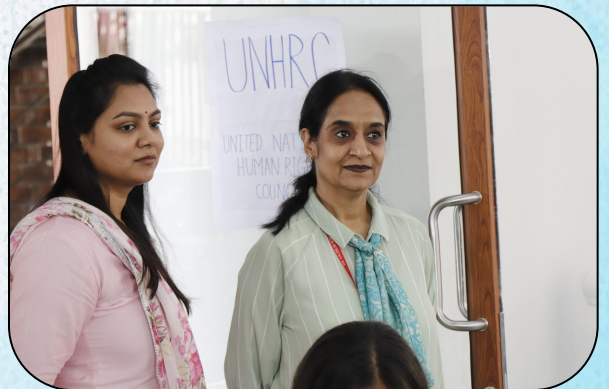
WHEN THE DIRECTOR AND PRINCIPAL VISITED