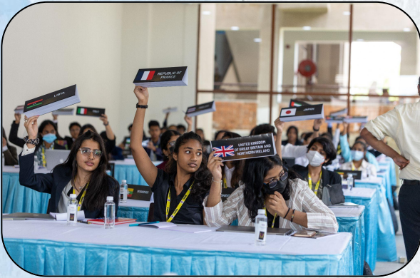
THE DELEGATES: UNITED NATIONS HUMAN RESOURCE COMMITTEE