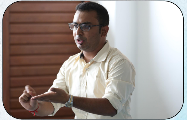
THE DELEGATES: UNITED NATIONS HUMAN RESOURCE COMMITTEE