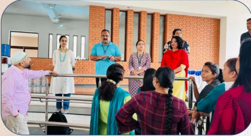
School tour for new teachers