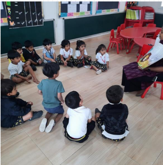
World Read Aloud Day