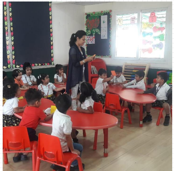
World Read Aloud Day