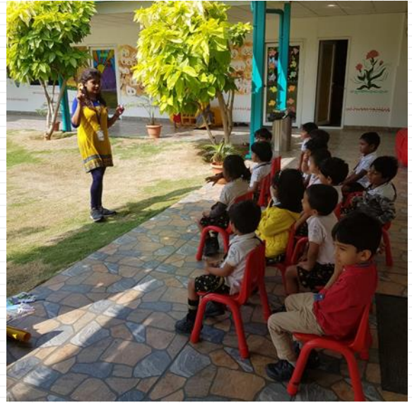
World Read Aloud Day