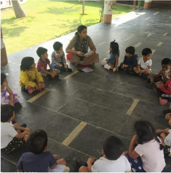
World Read Aloud Day