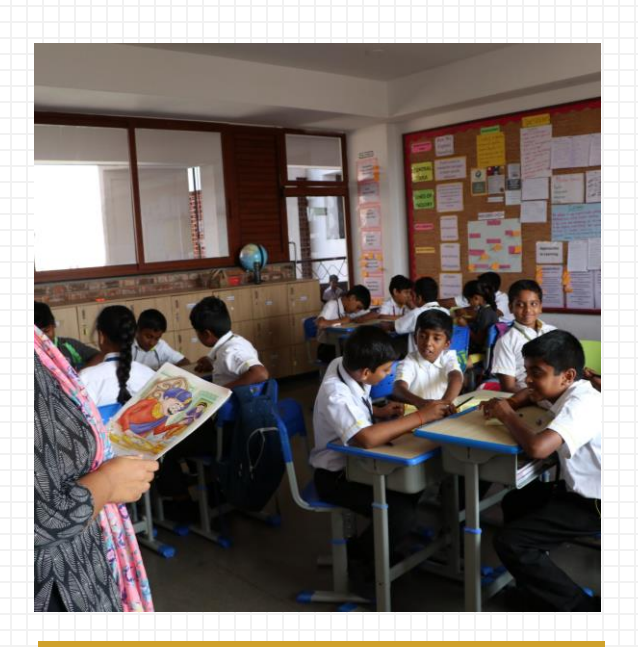
Facilitators reading aloud to the geckos