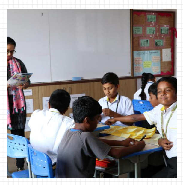
Facilitators reading aloud to the geckos