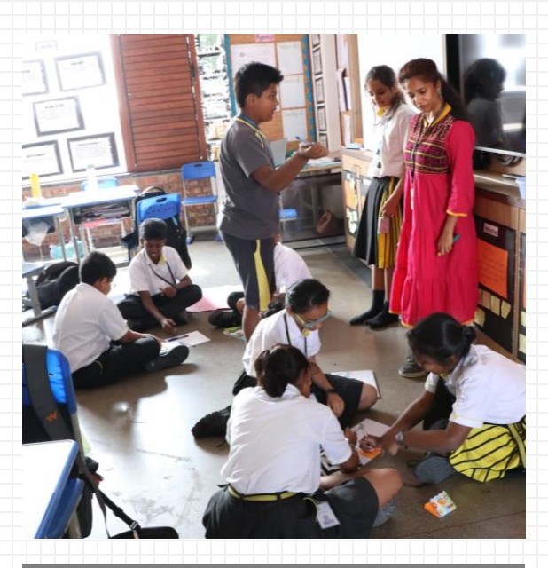
The geckos reflecting on the event