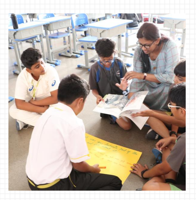
Facilitators reading aloud to the geckos