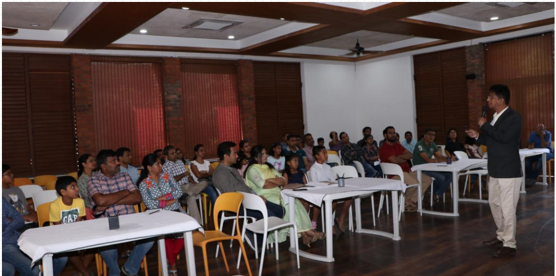
IB MYP Orientation