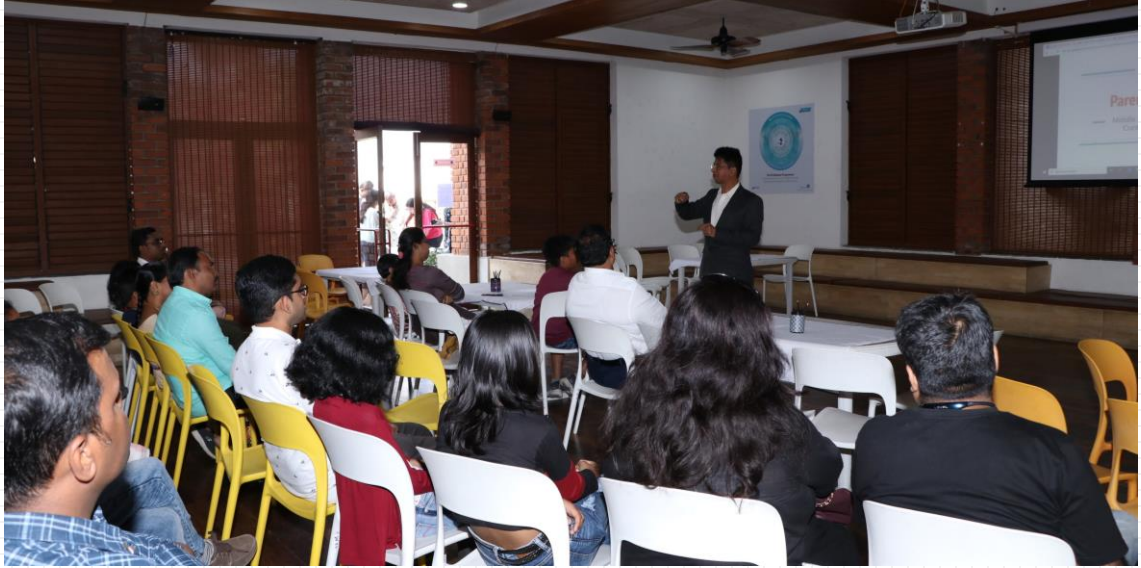
IB MYP Orientation