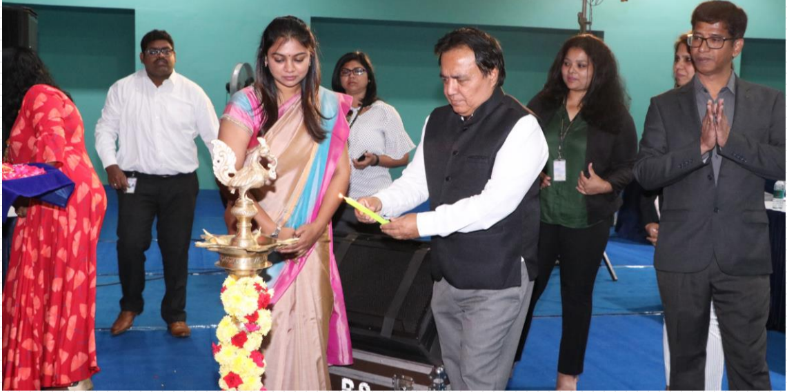
Inauguration of the session