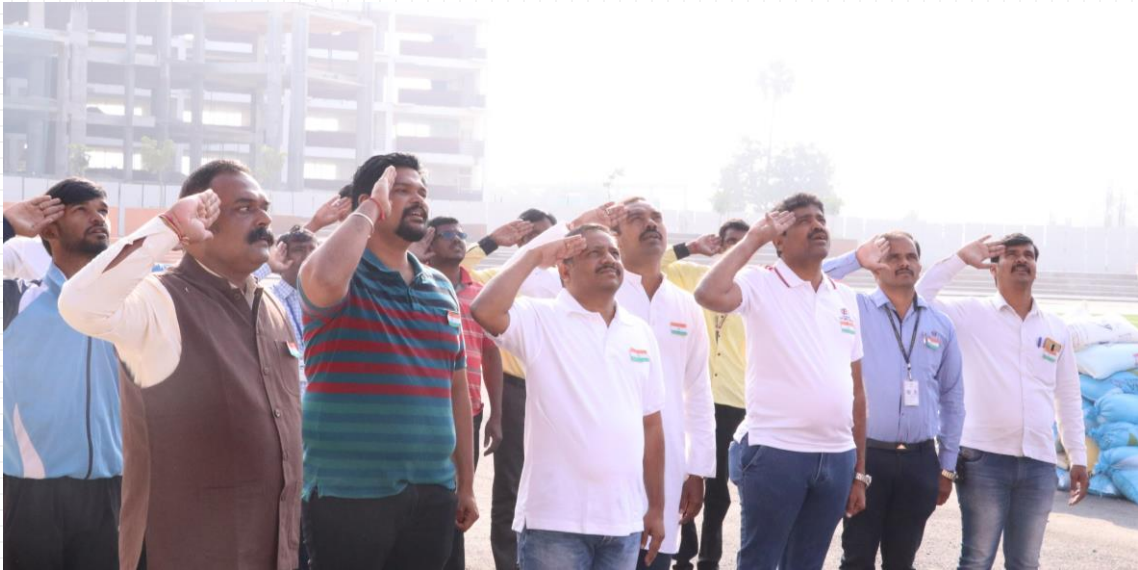
Republic Day Celebrations