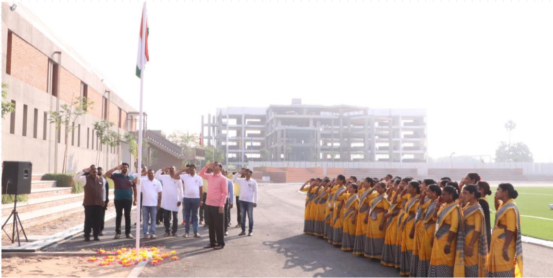
Republic Day Celebrations