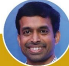
Pullela Gopichand Padma Bhushan Awardee / India National Team Coach Mentor, Centre of Excellence for Badminton, Gaudium Sportopia

In this era of gadgets, an infrastructure like Sportopia is indeed a boon. Sports initiate responsibility in children. Building an infrastructure like this would mean the world to children to learn sport. The infrastructure will make sure that children are excited and go out there and play and more importantly it will help teach them life lessons.