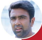
Ravichandran Ashwin Arjuna Awardee / Legendary Indian Player Mentor, Centre of Excellence for Cricket, Gaudium Sportopia

In this era of gadgets, an infrastructure like Sportopia is indeed a boon. Sports initiate responsibility in children. Building an infrastructure like this would mean the world to children to learn sport. The infrastructure will make sure that children are excited and go out there and play and more importantly it will help teach them life lessons.