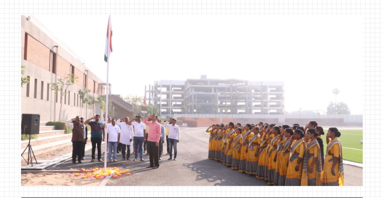
Republic Day Celebrations