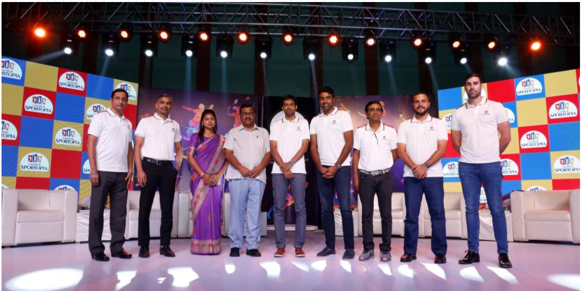
The Grand Launching Ceremony of The Gaudium Sportopia!