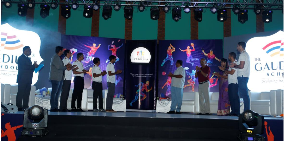
The Grand Launching Ceremony of The Gaudium Sportopia!