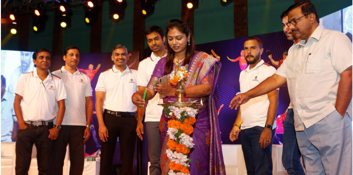
The Grand Launching Ceremony of The Gaudium Sportopia!