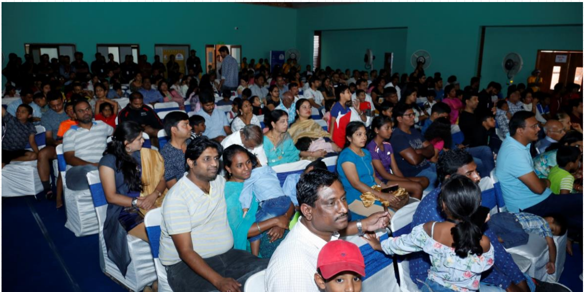
The Grand Launching Ceremony of The Gaudium Sportopia!