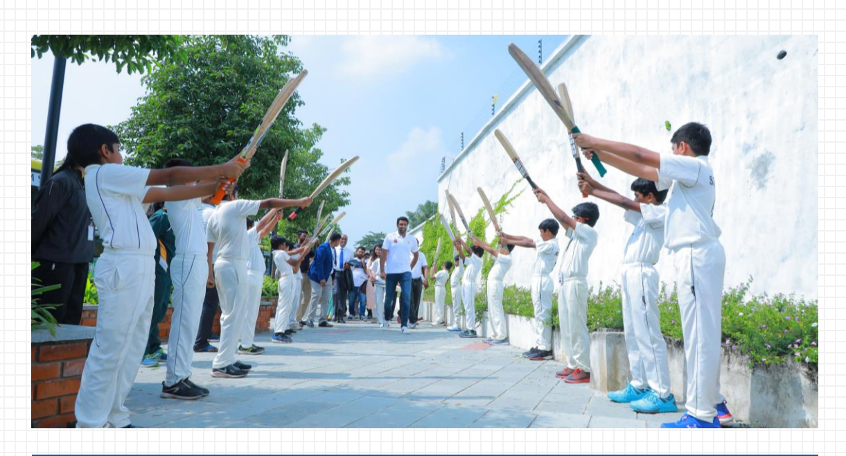
Grand welcome by the Gaudium cricket team to one of the best players of today