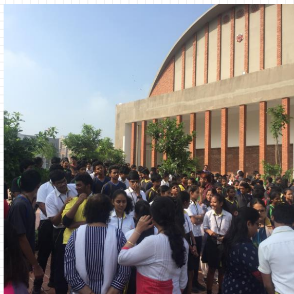
High School Assembly