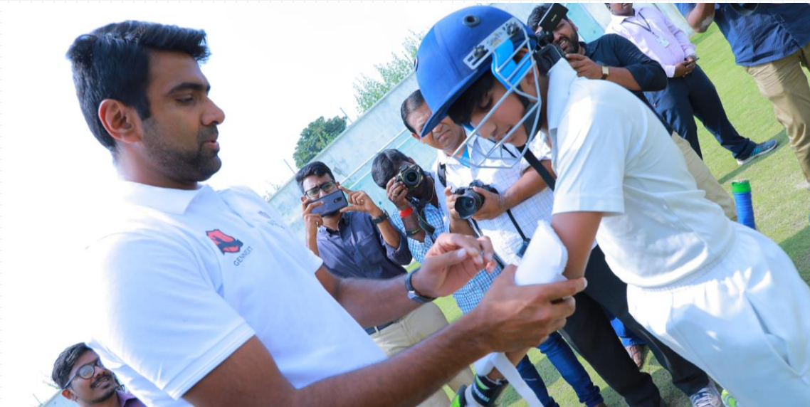
Launch of Cricket Academy