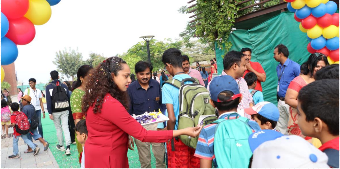
Grand Welcome for the geckos