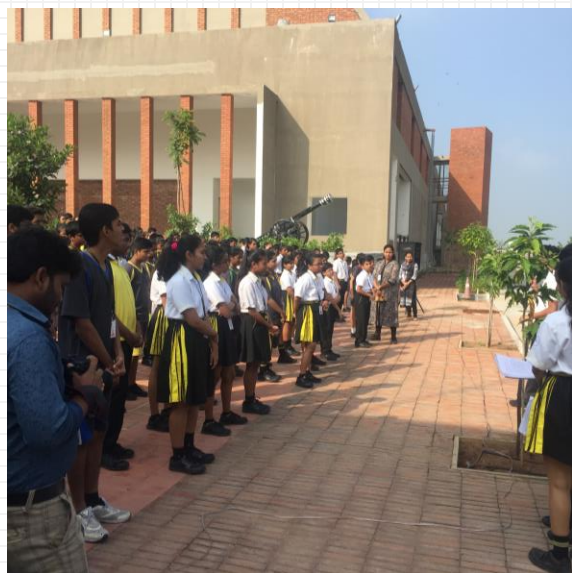
High School Assembly