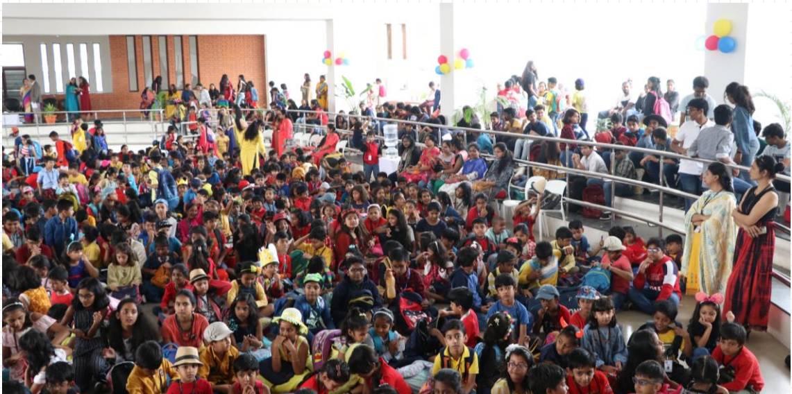
Celebrations across the school