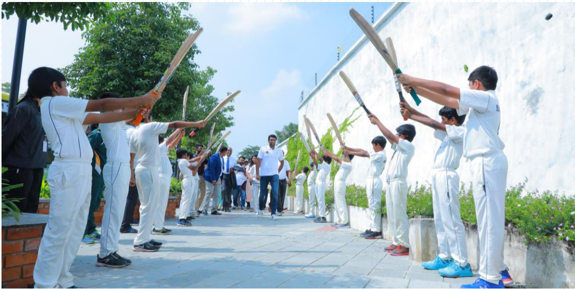
Grand welcome by the Gaudium cricket team to one of the best players of today