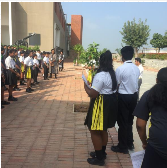
Felicitation of the sports Achiever