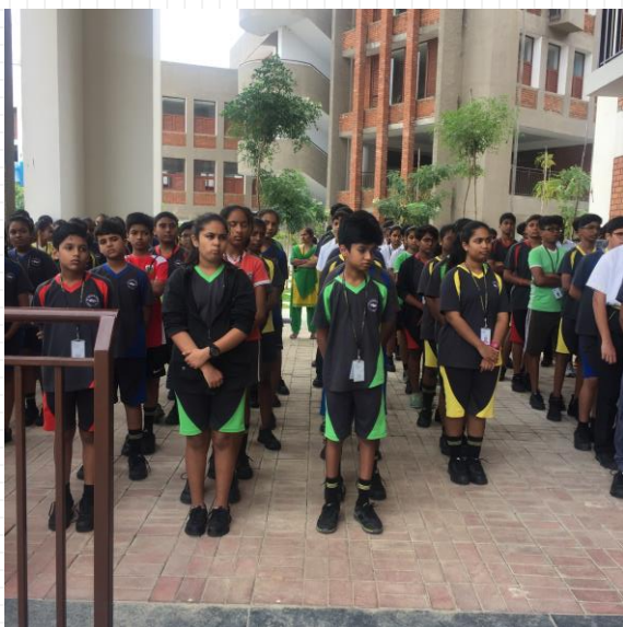
High School Assembly