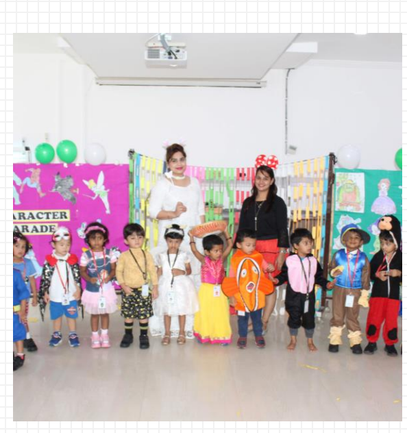
Nursery - B