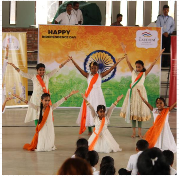
Independence Day Celebrations