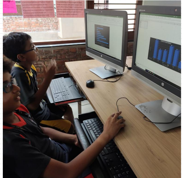
Making bar graphs