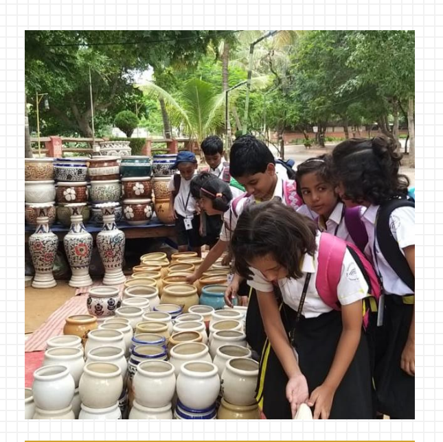
Field trip to Shilparamam