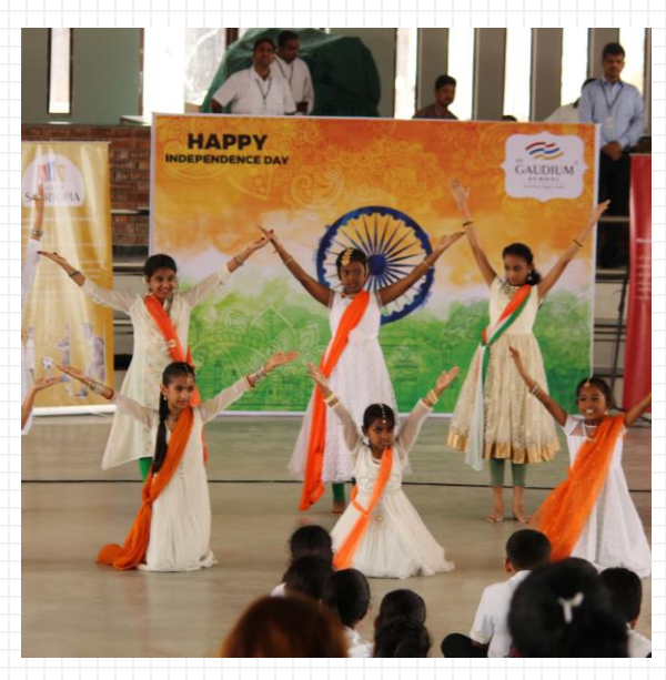
Independence Day Celebrations