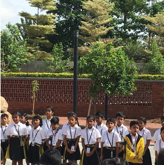
Grade 2 D Assembly Presentation