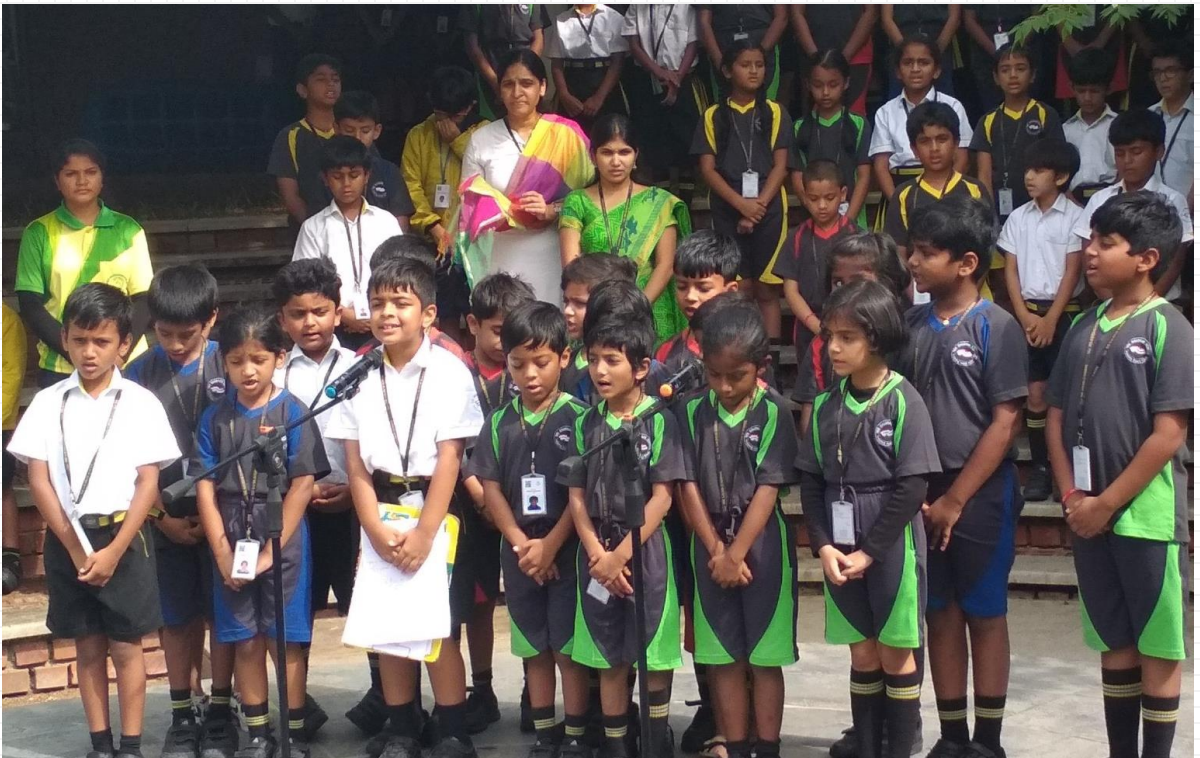
Grade 2 G Assembly Presentation