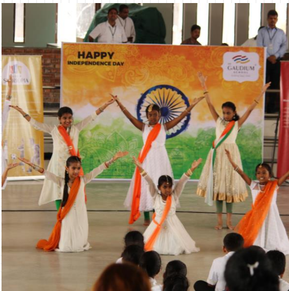
Independence Day Celebrations