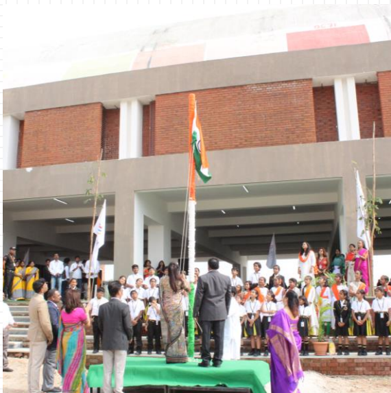
Independence Day Celebrations