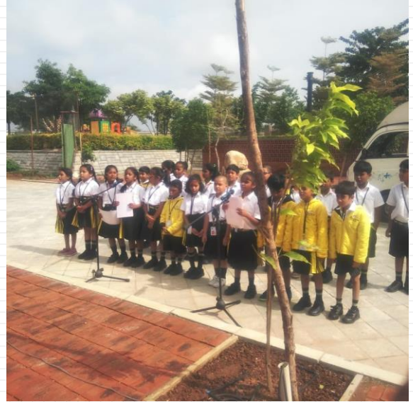
Grade 2 F Assembly Presentation