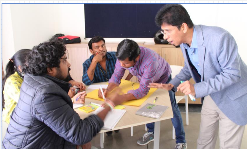
Transferring knowledge and experience