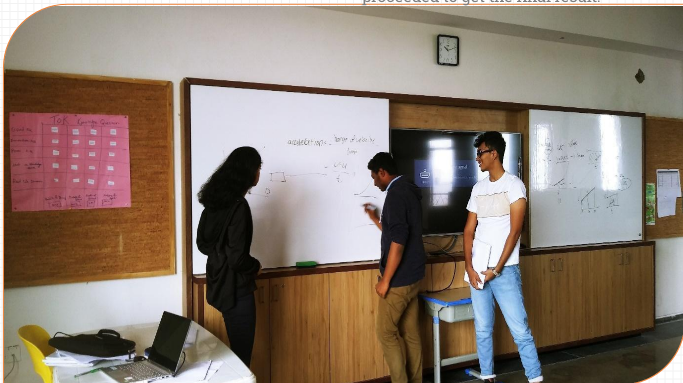
Teaching peers – learning from peers

The students were asked to find out the density of a given with some given apparatus. They were first expected to design the experiment to meet the objective of the experiment. The students found out mass with the spring balance and then found out mass with the digital balance. They then found out the volume of the given spherical bob using ruler and string and compared it with more precise instruments. The students justified the difference in the experimental data by listing out the types of errors that they committed while collecting the data. Finally, they learnt plotting graph with uncertainty in Excel sheet. They have shown improvement in collaboration and calculation skills where at each stage, they discussed among themselves and proceeded to get the final result.