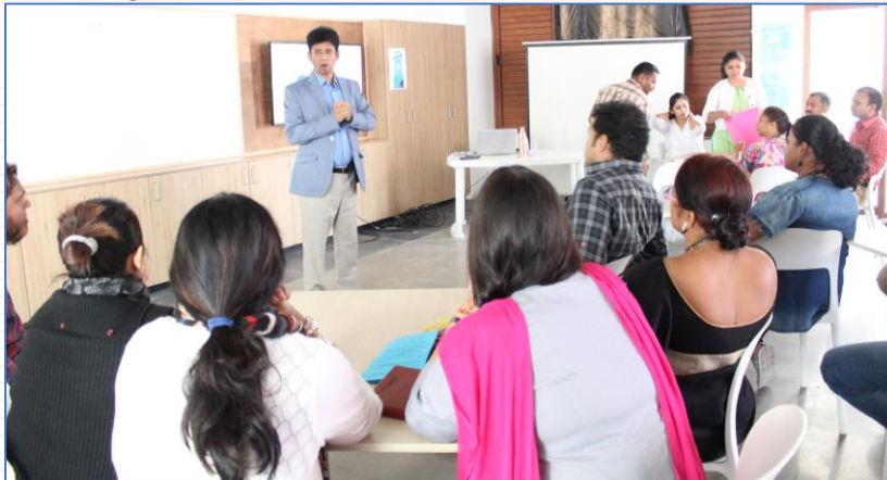
Facilitating professional development

The discussion helped teachers to understand the advantages and importance of classroom engagement based on inquiry and concepts and the importance of building skills over textbook- driven teaching. The session was insightful in providing teachers the understanding about the essentiality of inter-groups and the subjects groups collaboration for balancing the learning outcomes.