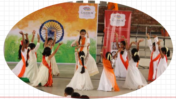
Dancing the heart out in pride; extolling the nation

It was a moment of unity that demonstrated nationalism when all present sang the song 'Saare jahan se acha...' together, which concluded the celebrations. For the geckos, it was a celebration that retold the history of India's freedom struggle and a call for further action and hard work for India's bright future.