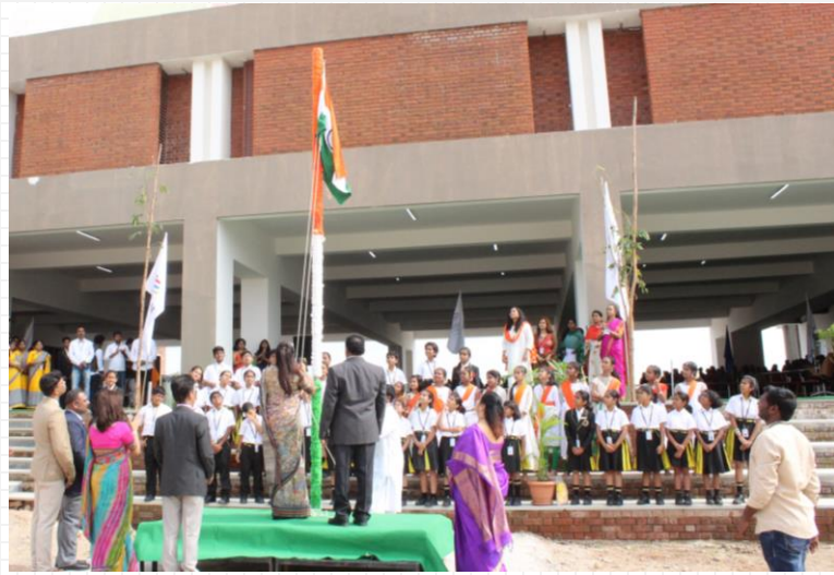
Waving and fluttering in pride