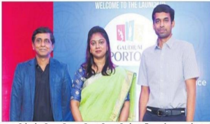
భవిష్యత్లో టీమిల్ టెన్నిస్, టెన్నిస్, ఫుట్ బాల్, అడ్రెటిక్స్, సిమ్మింగ్, వాలీబాల్, బాస్కెట్ బాల్, సాఫ్ట్ బాల్, క్రీకెట్, జిమ్నాస్టిక్స్, బాక్సింగ్, స్వూరర్, హాకీ, టేబిల్ టెన్నిస్, యమ్, స్పెటింగ్, జూడో, రెక్వాండో, క్రూటి, వేస్, మాటింగ్, అర్చరీ, రెజ్లింగ్, ఫెర్టింగ్, కబడ్డీ, యోగా క్రీడాశాలలోనూ అలాంటివి నెలకొల్పాలని గాడియమ్ స్కూల్ భావిస్తుంది.